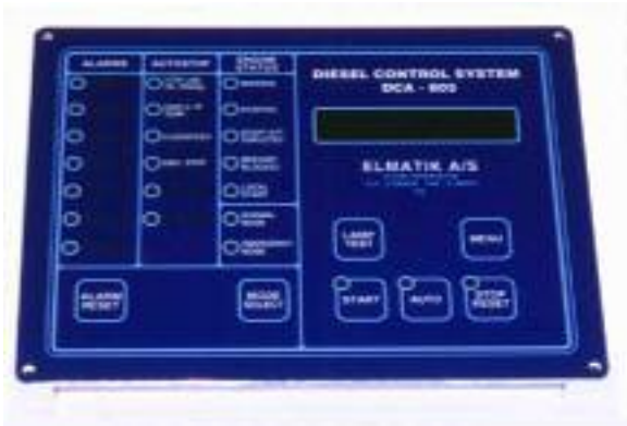
DCA - 805 panel (embedded)

DCA-805 is a 2nd. generation diesel start system from ELMATIK. It's designed for start/stop and surveillance of different types of diesel engines. The system is based on a modern microcontroller to achieve a large flexibility and to be user friendly. With ease the DCA-805 can be controlled by an external main or supervising system. The front panel has separate indications for auto stop, alarms and motor status, in addition to a LCD to display functions and the engine RPM. When the engine has stopped, the LCD will be able to display the engine parameter with explaining text in English and the programmed values. Programmed values can easily be reprogrammed and will automatically be stored. All inputs are separated with photo couplers and are shielded with EMI filters. Relays for the outputs are mounted on the terminal board, which is a separate unit and can be loaded with max. 2 Amp. 24VDC.